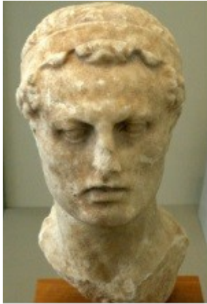
Antiochus IV Epiphanes

Antiochus IV Epiphanes who ruled the Seleucid Empire from 175–164 BC is identified as the little horn who stopped the daily sacrifices and caused the transgression of desolation by dedicating the temple to Zeus and trampled it underfoot.